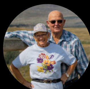
ROCKING HEART RANCH, AB RANCH HORSE BREEDER OF THE YEAR