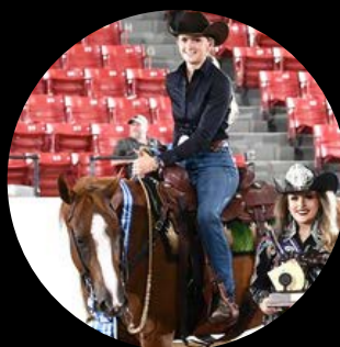
WHIZENBOONSMAL "PETER THE GREAT" CANADIAN BRED/OWNED HORSE OF THE YEAR