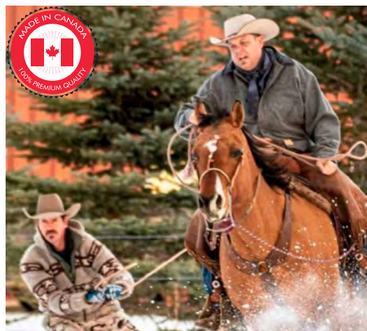
This great photo of "True Dreams Chance" Skijoring was sent to us by Spur West Event Center in Alhambra, Alberta, last spring. True Dreams Chance is a 2007 Canadian bred gelding by Dreams N Legends out of Imperial Pepperette by True Imperial Nugget.

The NCC is continuing the search for other qualified candidates that could be recommended to the board of directors for consideration to fill, by appointment, the 2 one-year terms that are vacant.